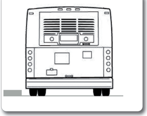
Front view of bus